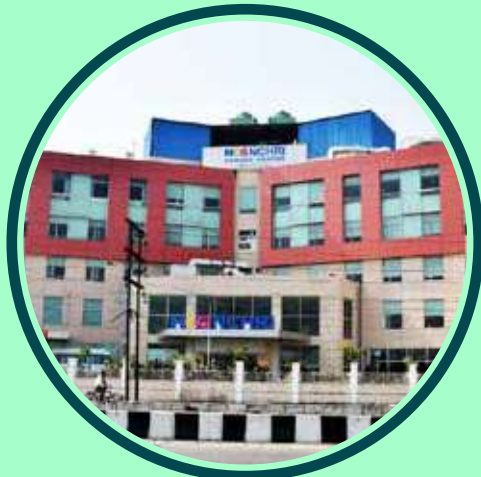
HCG Hospital Nagpur