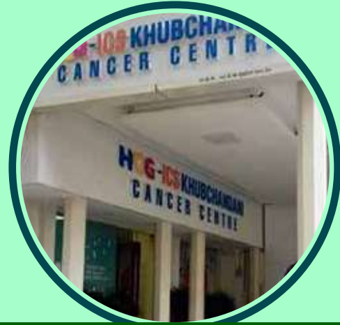
HCG Hospital Colaba