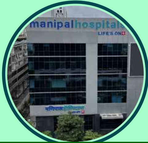
Pune Manipal Baner