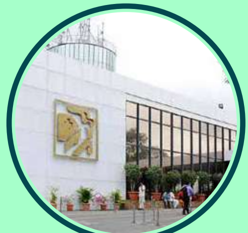
Apollo Jubilee Hills