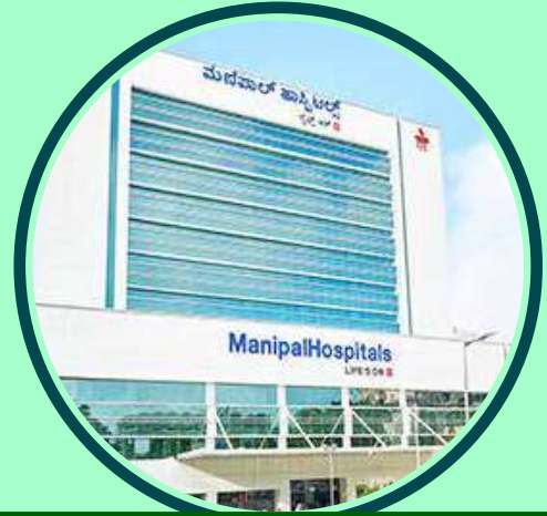
Pune Manipal Kharadi