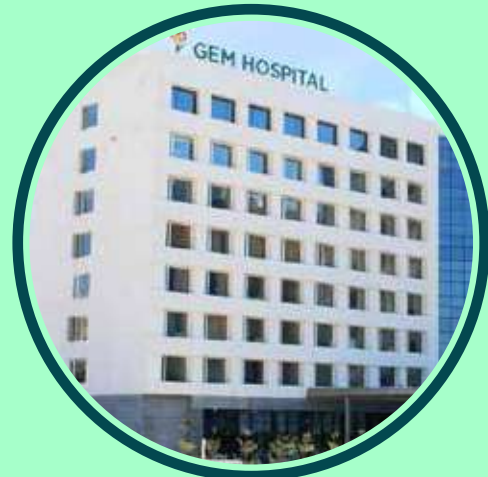
Gem Care Hospital